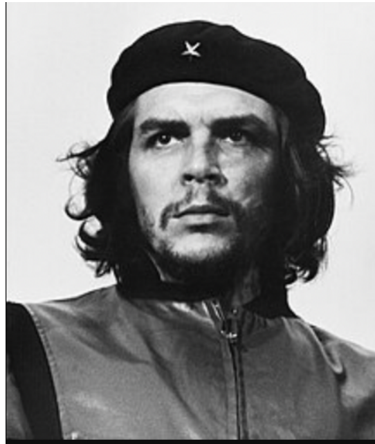
ERNESTO "CHE" GUEVARA