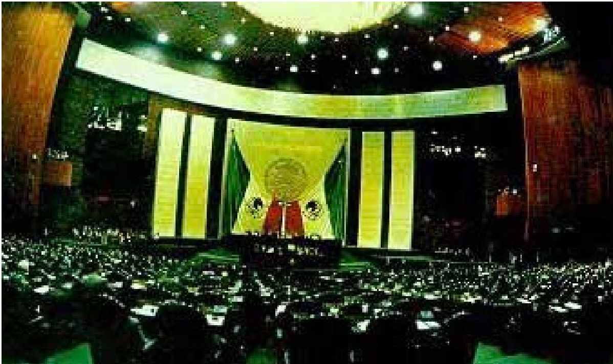
IMÁGEN DE LA CÁMARA DE DIPUTADOS

Después del asesinato de el excandidato del PRI, Luis Donald Colosio, la cámara de diputados busca qué rutas puede tomar para reducir las repercusiones. Uno de nuestros reporteros acudió a la misma Cámara de Diputados para conseguir más información sobre el tema.